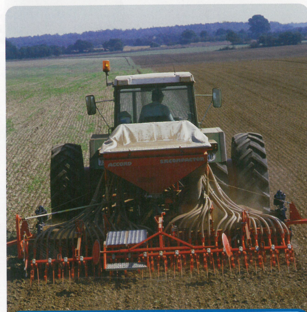
3 sowing the seed