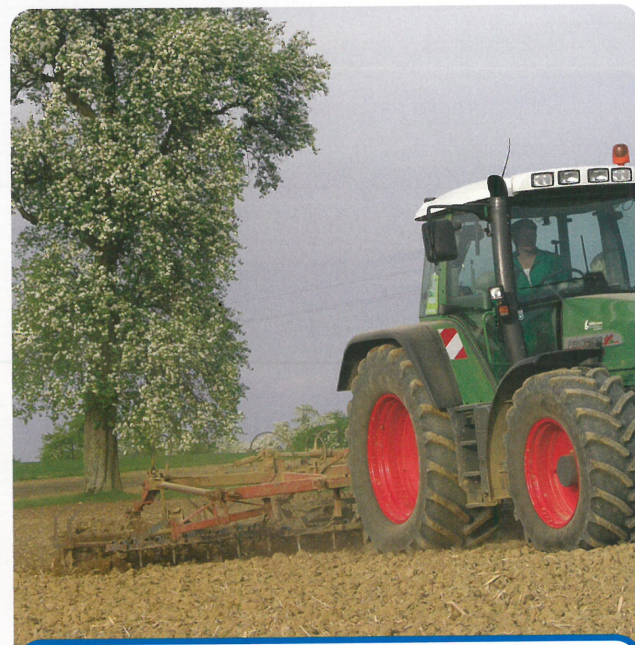
2 raking the soil